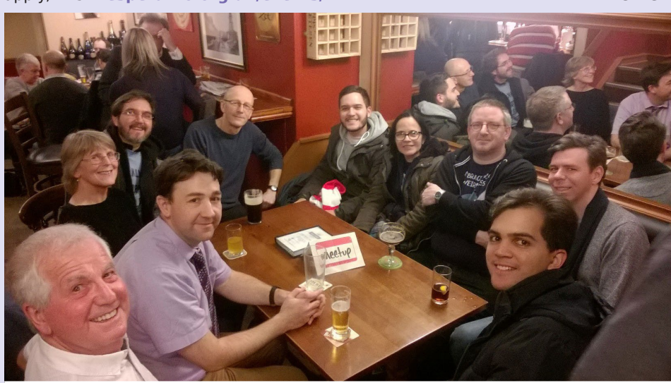
The Birmingham Meetup group meeting in Wolverhampton in December 2017, including people from Italy, Iran, Australia, Poland and Brazil.